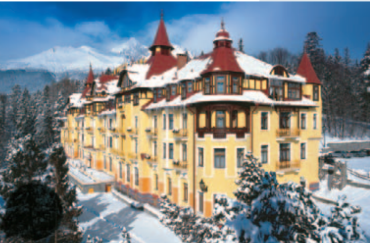
Grandhotel Praha, Tatranská Lomnica

www.hotelpatria.sk www.hotelpanorama.sk www.grandhotel.sk www.grandhotelpraha.sk