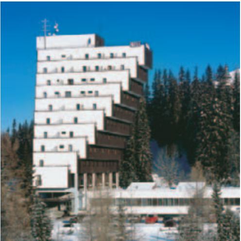
Hotel Panorama, Štrbské Pleso

in the Tatras is provided by discotheques, hotel bars, wine bars and occasional social events, which take place especially during the main seasons.