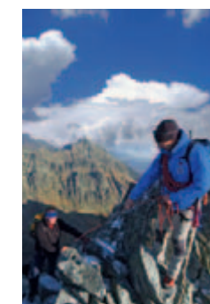
Gerlachovský štít - the highest peak in the Tatra mountains

The most tempting challenge for mountaineers is the 900 m northern face of Malý Kežmarský štít . It is the largest rock face in the High Tatras and can be seen from the Chata pri Zelenom plese – the “Hut beside the Green Lake”. The name of the mountain hut that draws the largest number of visitors - Chata pri Popradskom plese (1500 m) - reflects the fact that it stands at the edge of Poprad Tarn. Its predecessor was destroyed by fire, as was the first hut on this site, which was built in 1881 on the initiative of the Carpathian Society of the Hungarian Kingdom. An easy climb from Štrbské Pleso brings you to the present hut, which has a capacity of 124 beds.