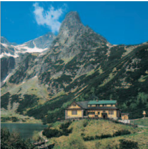
Chata pri Zelenom plese (Hut beside the Green lake)

The oldest stone hut, known as Rainerova útulňa ("Rainer's Shelter"), dates back to 1863 and since its reconstruction it has offered a little exhibition of the history of mountain porters. This hut was followed by the Chata pri Zelenom plese ("The Hut by the