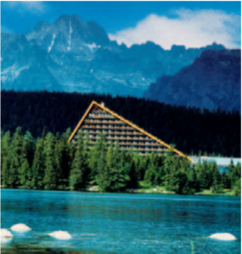
Hotel Patria, Štrbské Pleso

The most important Tatra centres - Starý Smokovec, Štrbské Pleso and Tatranská Lomnica have a large number of catering facilities, from luxury hotel restaurants, traditional Slovak koliba restaurants with an excellent atmosphere and gypsy music, to cosy coffee bars and self-service canteens. Although it cannot be compared to that in the towns, the night life