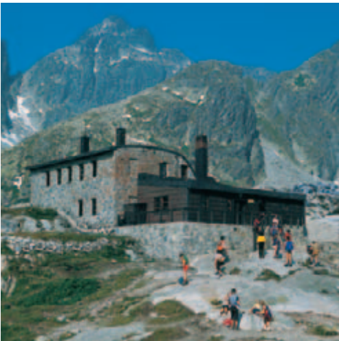
Téryho chata - the mountain hut in Malá Studená dolina (Little Cold Valley)

Green Lake", 1551 m), Sliezsky dom (1970 m) next to another lake, Velické pleso and Zbojnická chata ("The Outlaws' Hut", 1960 m) at the upper end of Velká Studená dolina ("The Great Cold Valley"). The highest one is Chata pod Rysmi ("Hut below Risy", 2250 m), which is supplied