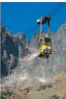
Cabin cableway from Skalnaté Pleso to Lomnický štít

is 6040 m long, with an elevation difference of 1722 m. Until 1958 its technical parameters were comparable with the best cableways in Europe. In 1986-1989 it underwent radical reconstruction. Although the capacity of the cable car from Skalnaté Pleso to Lomnický štít did not change (15 persons), its parameters were updated to meet modern world standards, its safety increased and level of comfort improved. The services of this transport route are used not only by tourists