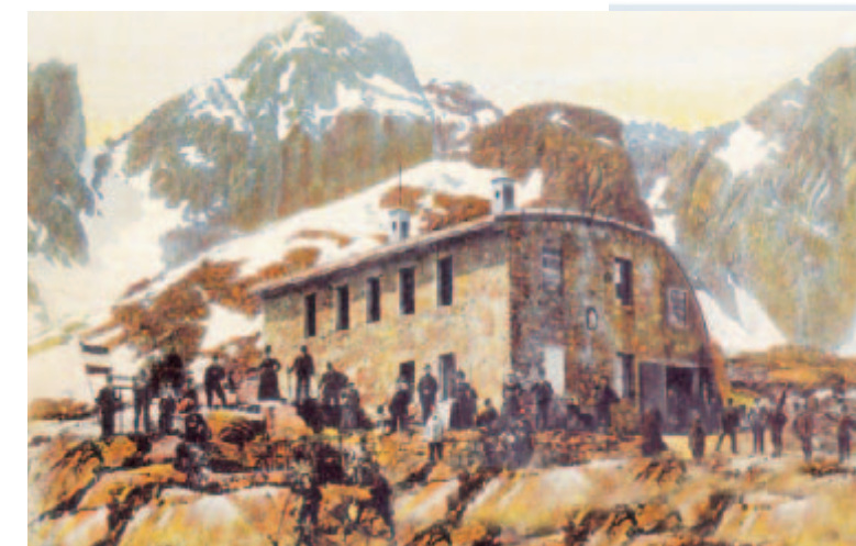
Téryho chata – a mountain hut

The convalescent homes and sanatoriums with their characteristic wooden architecture intended for the more exacting clientele were enhanced by the addition of large parks, music stands and playgrounds. The Tatra villages were then connected by the construction of a road known as Cesta slobody, along which the first motor vehicle passed in 1900. The tourist and climatic centres improved in quality, with new luxury hotels and private villas, and the cableways began to be built. The railway network was completed with an electric railway linking Poprad to Starý Smokovec and Tatranská Lomnica or Štrbské Pleso.