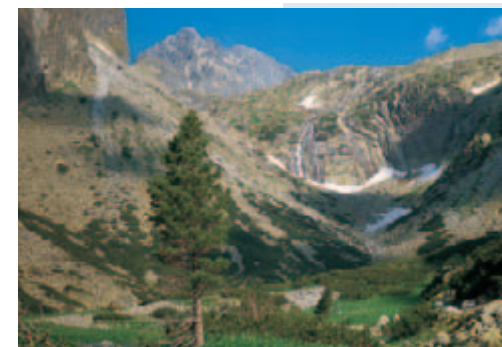
Malá Studená dolina (Little Cold Valley)