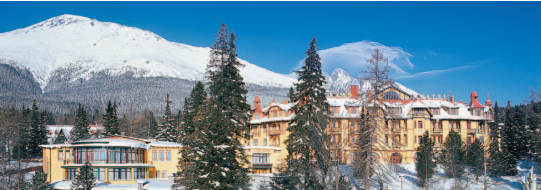
Grand Hotel, Starý Smokovec

Starý Smokovec was built and developed in the 19th century thanks to the local mineral springs. The other Smokovec villages also became famous on account of their wa-