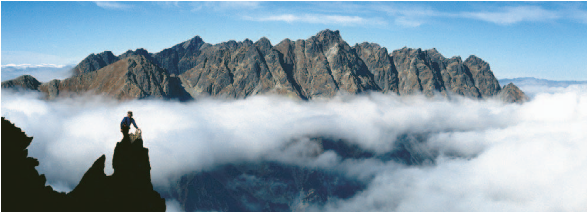
View towards the valley of Dračia dolinka