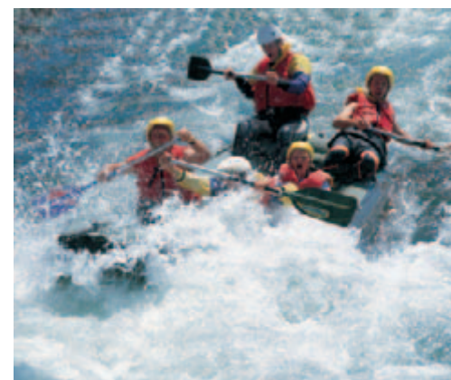
A trip down the River Belá

Ždiar, or to Pribylina, where you will find the Liptov Village Museum. Tourists can appreciate the healing power of the underground thermal waters twelve months in the year at the Tatralandia Aquapark near Liptovský Mikuláš and in AquaCity, Poprad. Last but not least, there is the Slovak cuisine with its national specialities. One of the popular traditional Slovak dishes is cabbage soup and the traditional Slovak halušky is to be found on menus in a variety of forms under various names: furmanské (drayman’s), bryndzové (sheep’s cheese),