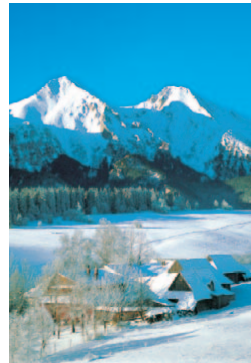
Ždiar - a typical Goral village