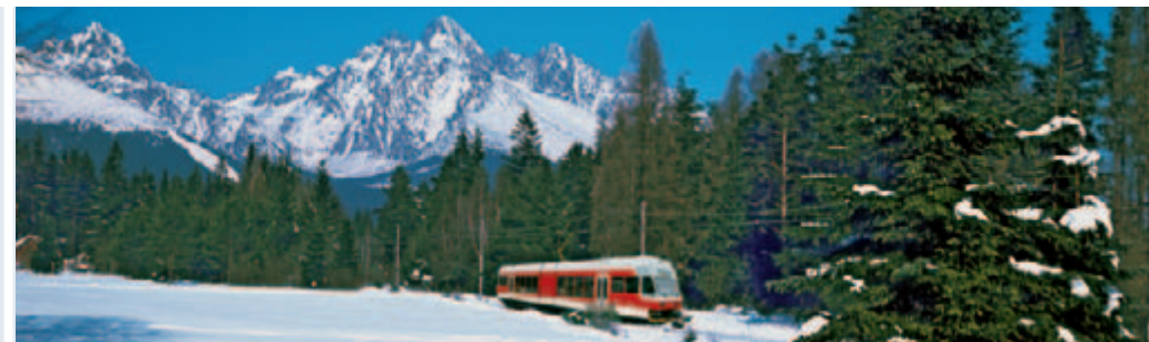
Electric rack railway from Štrba to Štrbské Pleso

The international gateway to the High Tatras is the Poprad-Tatry airport, only 12 km from Starý Smokovec. It is one of the highest situated airports in Europe, as it lies at an altitude of 718 m above sea level – which is higher than Innsbruck in Austria. It is the gate to 4 national parks, 5 heritage reserves in the nearby surroundings, as well as to the centres of winter sports and summer tourism in the High and Low (Nízke) Tatras, the Spiš and Orava regions. The airport is not only used by international and internal flights, but also by mountain rescue helicopters during rescues in the High Tatras.