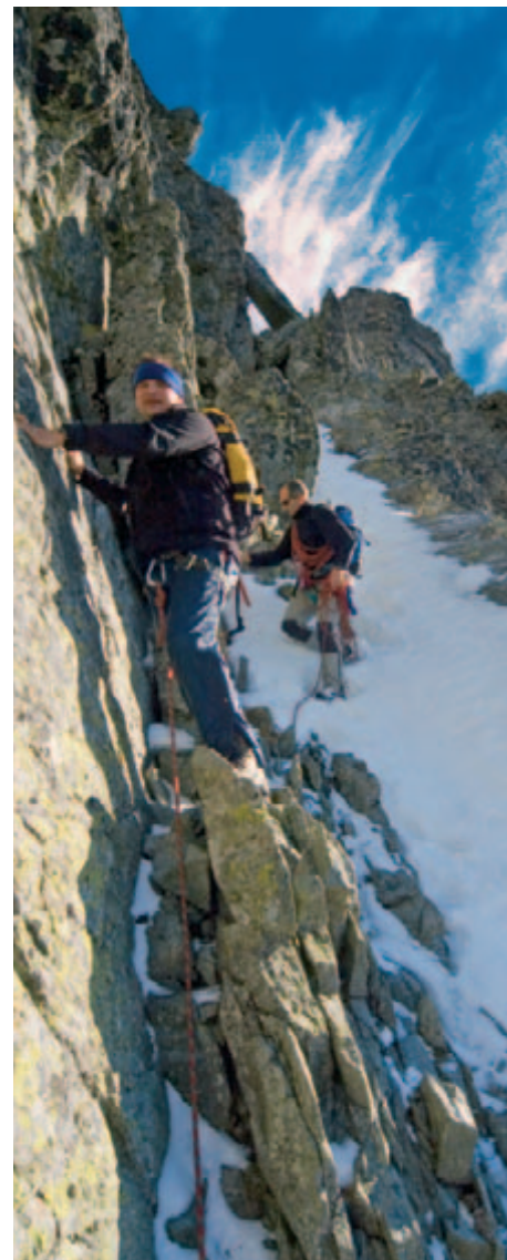
Climbing to the summit with a mountain guide

The tourist trails for visitors to the Tatra National Park are colour-marked (red, green, blue or yellow). Their total length is 600 km and they cover all the important hiking areas in the Tatras. They can be divided according to difficulty into easy walks, valley tours and ascents to higher spots - the saddles and peaks.