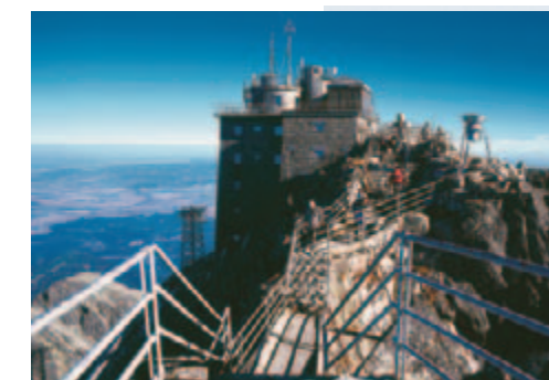
Lomnický štít - the greatest tourist attraction