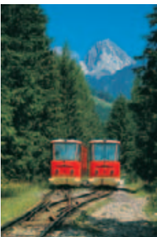
Funicular railway from Starý Smokovec to Hrebienok

The funicular from Starý Smokovec to Hrebienok was completed in 1908. Its two carriages cover the 354 m difference in elevation in a pendulum fashion. It underwent radical technical modernisation in 1970, when the world championships in classical skiing took place in the High Tatras.